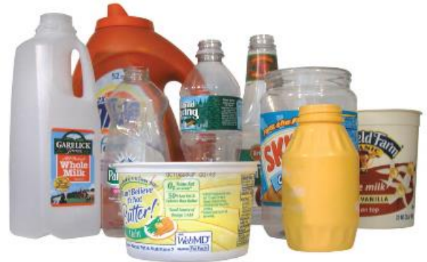
PLASTICS (#1, #2, #5 & #7)